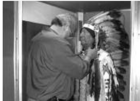
A conservator examines the bear claw necklace on Chief Plenty Coups

When Hershey Museum closed in September 2008, the clothing and embellishments were removed from the mannequins and evaluated by a team of conservators. "While some of the damage was obvious, it was not until the painstaking work of disassembling the mannequins was complete that we had a better idea of what lay ahead,"