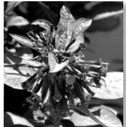
'Royal Queen Purple' Ipomoea

Look for the 36" tall 'Royal Queen Purple' and 'Peachy Keen' Ipomoea with their handsome tubular flowers. "Along with the annuals, we'll be incorporating perennials and shrubs to add new textures and height," notes Whitcraft.