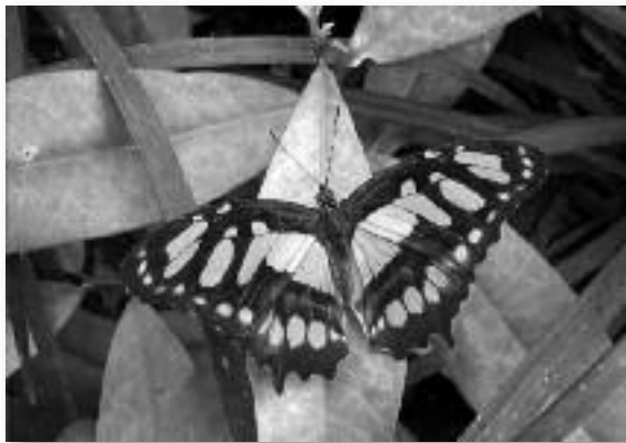
The malachite butterfly

Now in its 13th season, the Butterfly House opens on Friday, May 28. It is open daily, weather permitting, from 9 a.m. to 5 p.m. through September 12. In case of inclement weather, visitors are encouraged to call first: 717.534.3492.