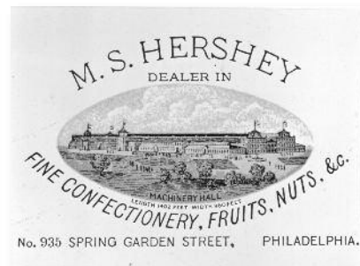
Milton Hershey business card, ca 1876-1880

conducting oral history interviews with employees and community residents, offering presentations and educational programming, and representing the entities at public speaking events.