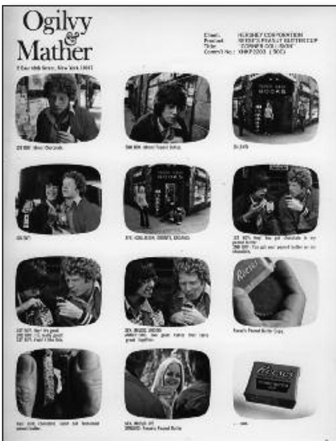
The "storyboard" used by Ogilvy & Mather for Hershey's first commercial for Reese's Peanut Butter Cups, which featured a collision of peanut butter and chocolate

Learn more little-known facts about Hershey advertising in 1968 at The Hershey Story's newest exhibit: "1968 in America," opening June 16. Read more on page 1.