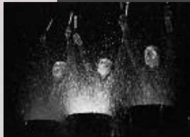
Blue Man Group