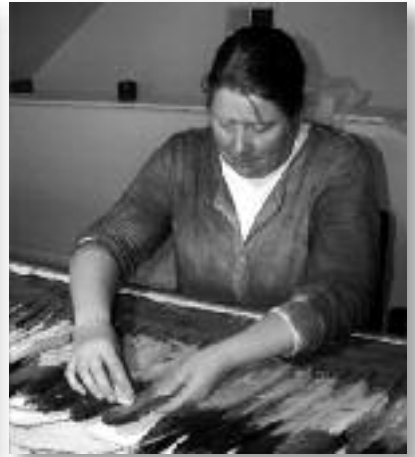
A conservator uses a dry sponge to clean eagle feathers on a headdress

"70 years of light exposure, as well as temperature and humidity fluctuations, took their toll on these artifacts."