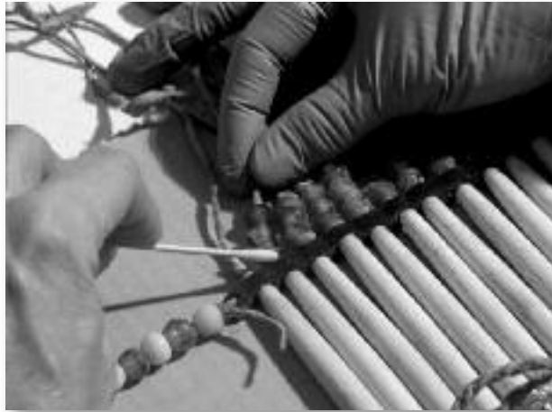
A swab soaked in ethanol is used to remove residue from the beadwork on a breastplate